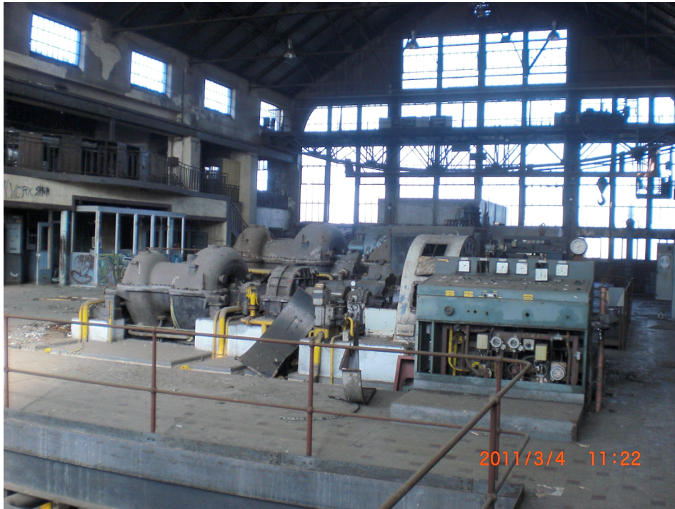
Fig. 6 Parc du haut-fourneau: Gas machines hall

Very interesting details, however, can still be detected in some of the buildings, such as a gently rounded steering balcony, revetted with marble, of the former power center with its – unfortunately heavily vandalized – gas machines. Most buildings' main structures are solid, so they can be turned in a variety of future uses. From a purely technical point of view, the site is remarkable due to its very specific charging facility, i.e. by help of vertical 'elevators'.