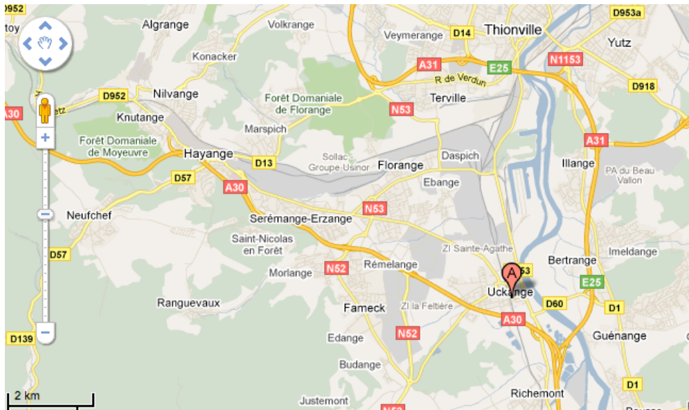
Fig. 4 The former center of Lorraine iron and steel production in the triangle formed by the Fensch and the Moselle valley (A: location of Uckange)

Uckange is one of the sites documenting the extension of Saar and Ruhr steel corporations after the annexation of Lorraine/Alsace by the German Reich in 1871 (result of the Peace of Frankfurt ). Other important iron production (and iron ore mining) sites were in the larger Thionville/Diedenhofen, Florange/Floringen, Hayange/Hayingen, Knutange/Knutingen and Algrange/Algringen area.