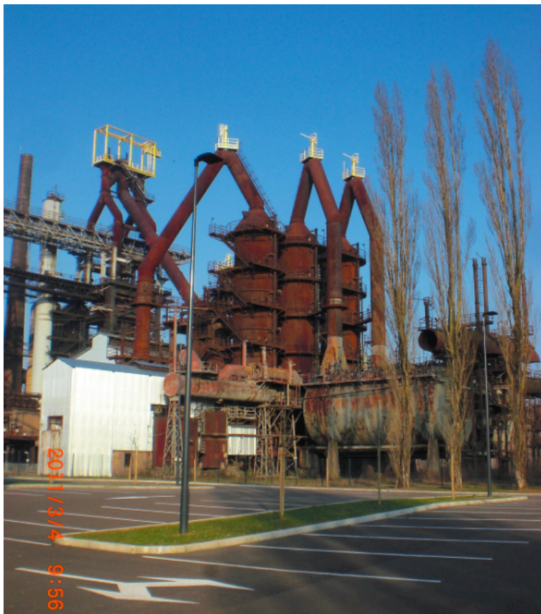
Fig. 5 The blast furnace no. 4: U4

The main remaining element of the former industrial site is the blast furnace itself and its cowpers, surrounded by some half a dozen buildings, most of them nothing more than empty shells in quite bad shape.