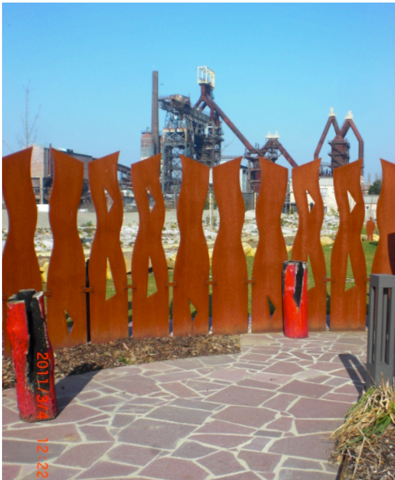
Fig. 8 Jardin des traces: Fire