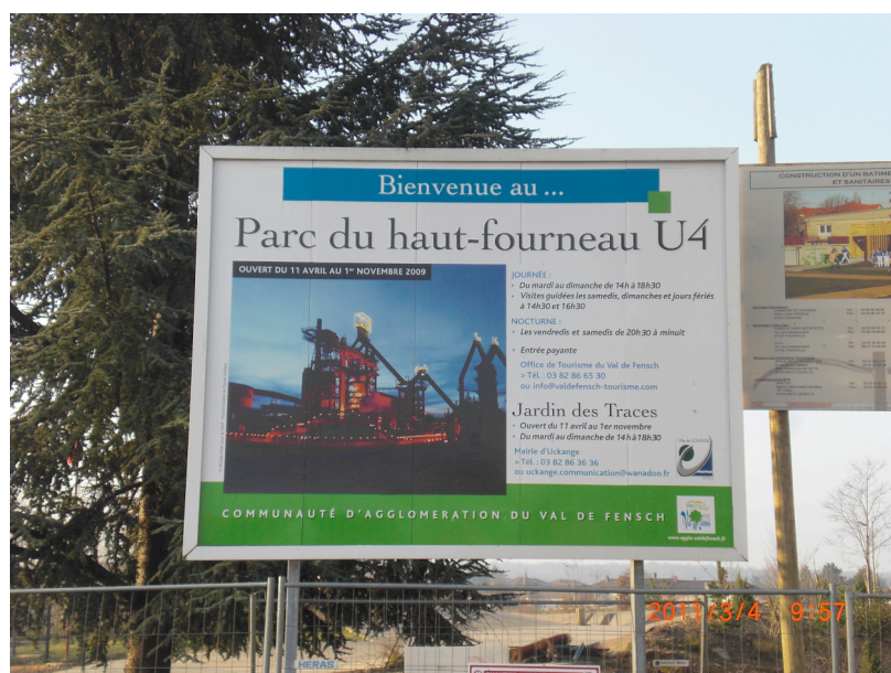
Fig. 2 Information at the entrance of the Parc du haut-fourneau U4