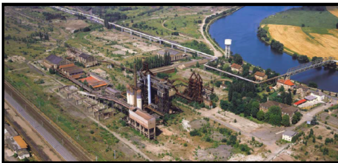
Parc du haut-fourneau U4 – Vue du ciel en 2005.