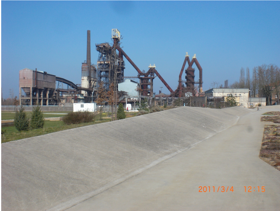
Fig. 7 View from the Jardin des traces towards U4