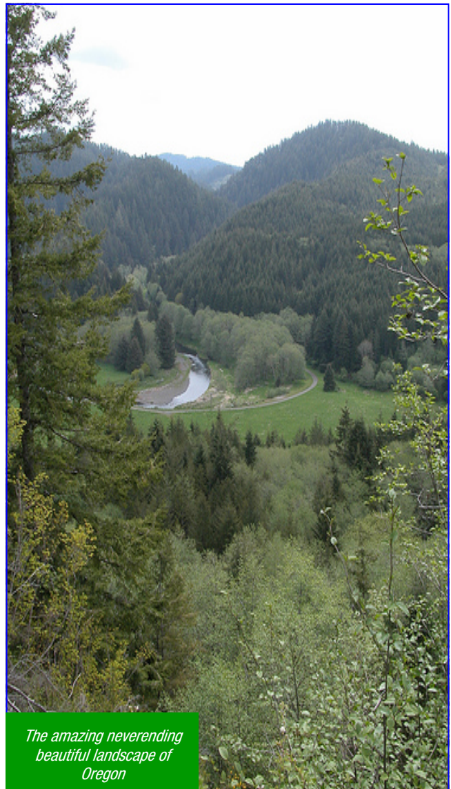
The amazing neverending beautiful landscape of Oregon