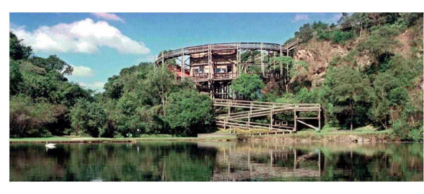
Curitiba Universidade Livre de Meio Ambiente The Award for Curitiba reads as follows "For more than a decade of creative efforts in eco development and sustainability in Curitiba. The recent 'eco-technology' vision to integrate excellence in environmental issues with that of the

Singapore JTC Corp., The Award for Singapore One North reads as follows: